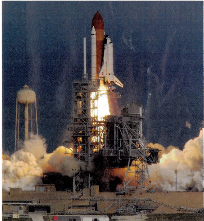
FutureFLEX air-blown fiber has been installed at NASA's Kennedy Space Center for high-bandwidth technologies required for the next generation of space travel.

Lawrence Wages, an outside plant engineer for NASA, notes, "Many of our projects—such as the immediate transmission via fiber of digital images showing the status of ice buildup on the space shuttle Discovery—resolve costly delays and life and death situations, if it's a manned spacecraft. By adopting an