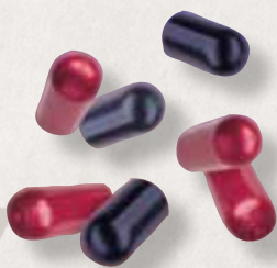
BE2MFT (red) and BE3MFT (black)